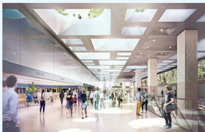
Station concourse at Parkville –concept design.

Attribution: The material for this station naming activity has been adapted from teaching resources produced by the Antarctic Division (part of Department of the Environment) for Classroom Antarctica, ©Commonwealth of Australia 2017. classroom.antarctica.gov.au