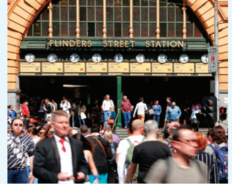
Flinders Street is named for the explorer Matthew Flinders.