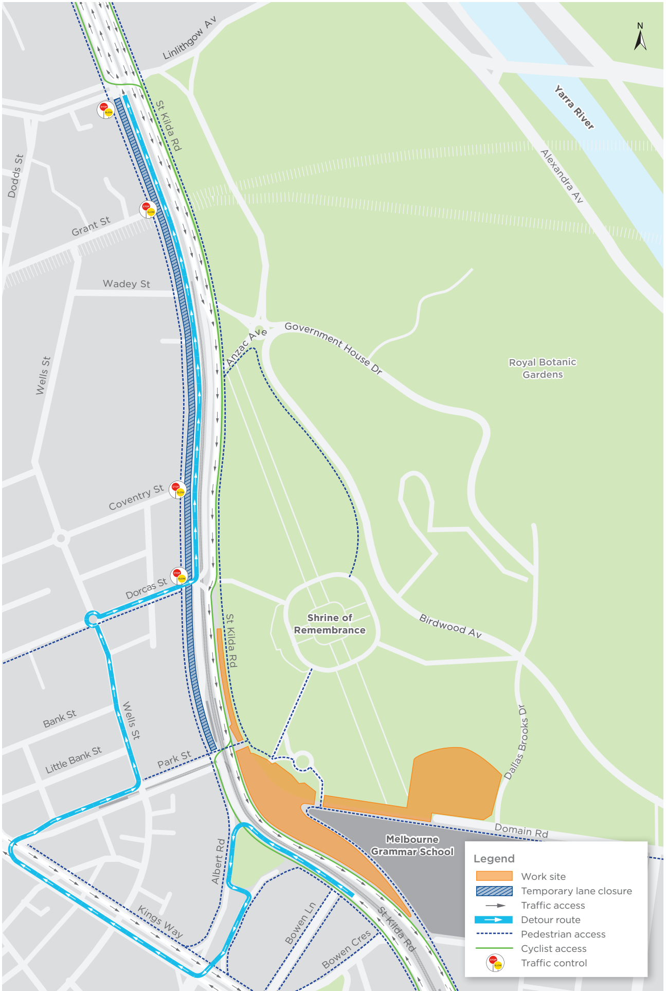
Map 2 – St Kilda Road temporary detour route