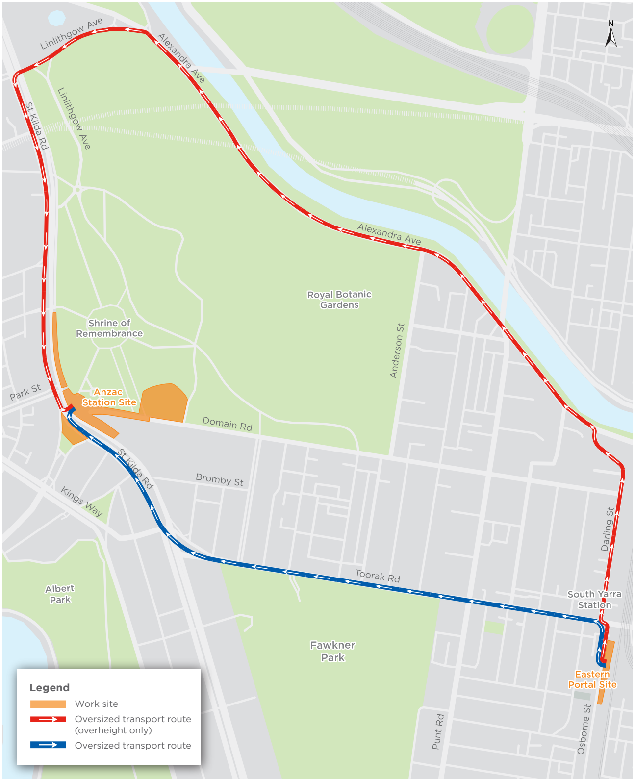
Map 1 - Oversized transport routes