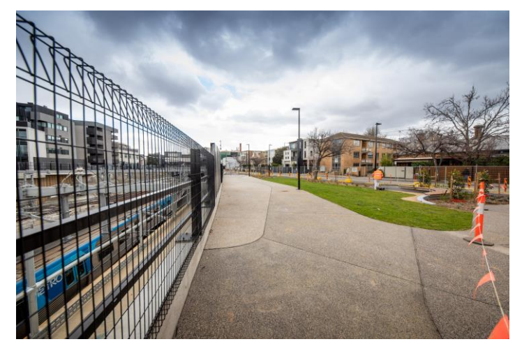
Arthur Street pocket park footpath