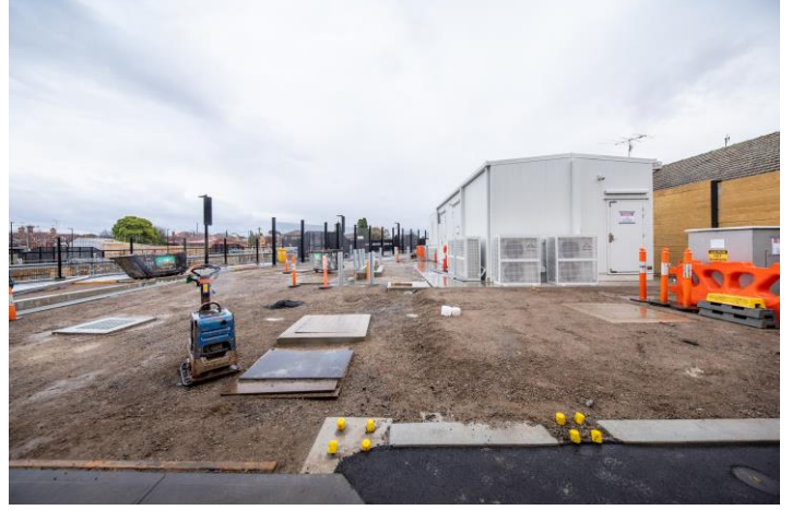
CER/SER site area