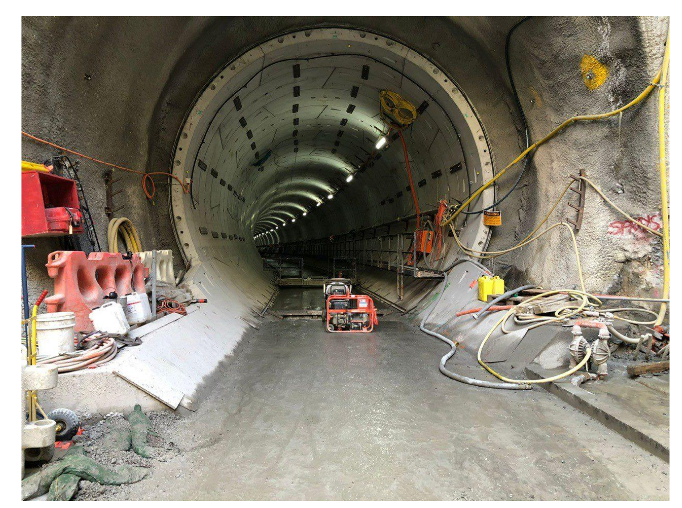
Eastbound tunnel invert complete