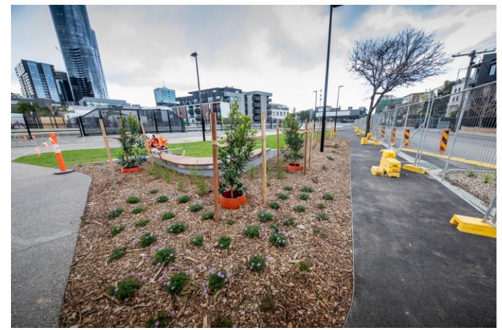
Arthur Street pocket park