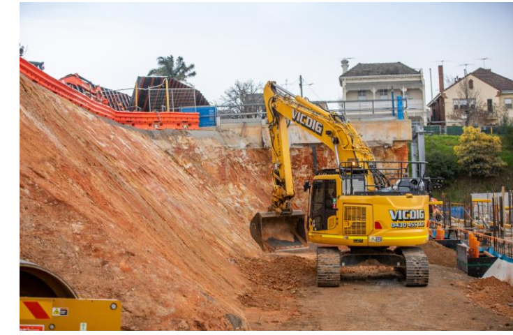
Siding Reserve works area