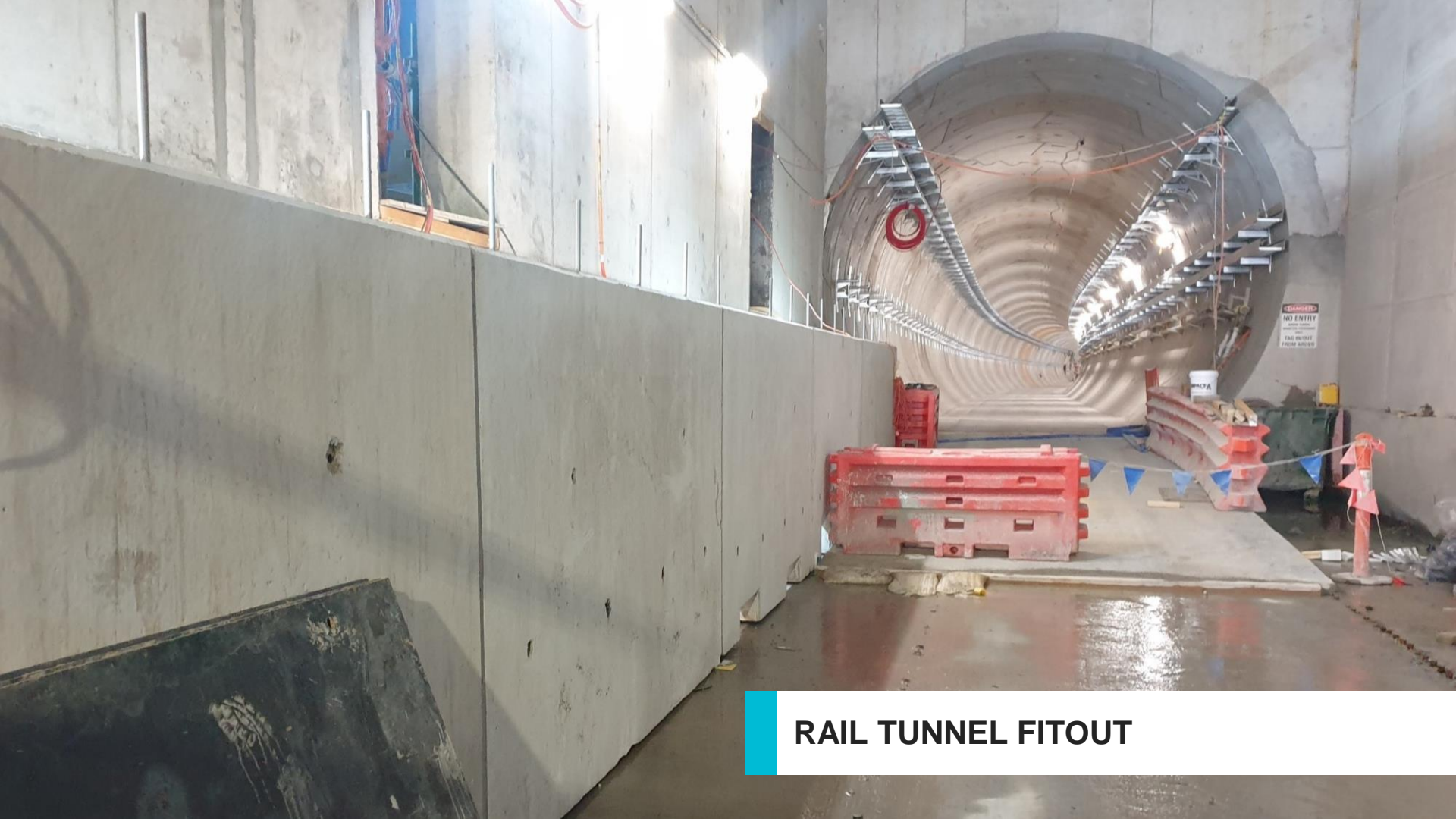
RAIL TUNNEL FITOUT