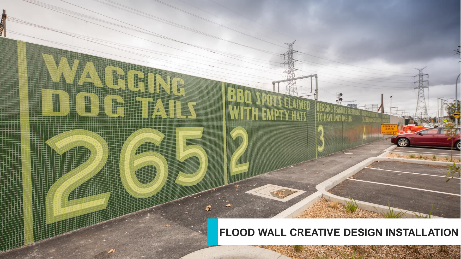
FLOOD WALL CREATIVE DESIGN INSTALLATION