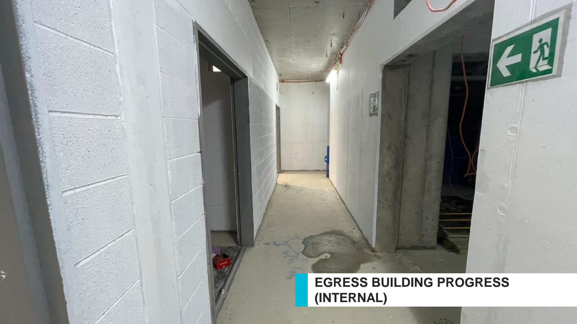
EGRESS BUILDING PROGRESS (INTERNAL)