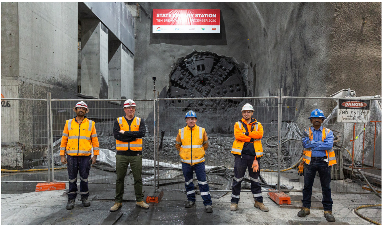
TBM Joan breakthrough to State Library Station - December 2020