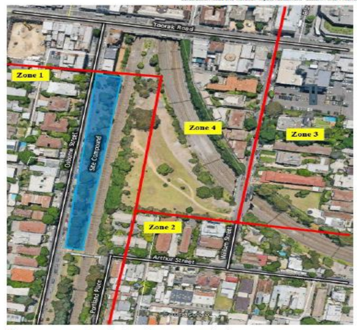
Figure 5: Background noise monitoring locations and nearby residential areas

Metro Tunnel Project - Tunnel and Stations PPP Package outtraction Noise and Vibration impact Assessment -Eastern Fortal Product