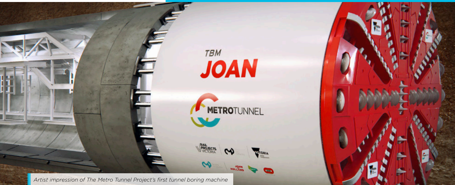
Artist impression of The Metro Tunnel Project's first tunnel boring machine

The Metro Tunnel Project will deliver twin nine kilometre rail tunnels from Kensington to South Yarra as part of a new end-to-end Sunbury to Cranbourne/Pakenham line. In addition to the tunnel, five new underground stations will be built.