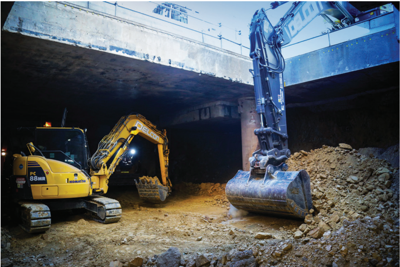
View from underneath the ground floor slab at the La Trobe Street site.