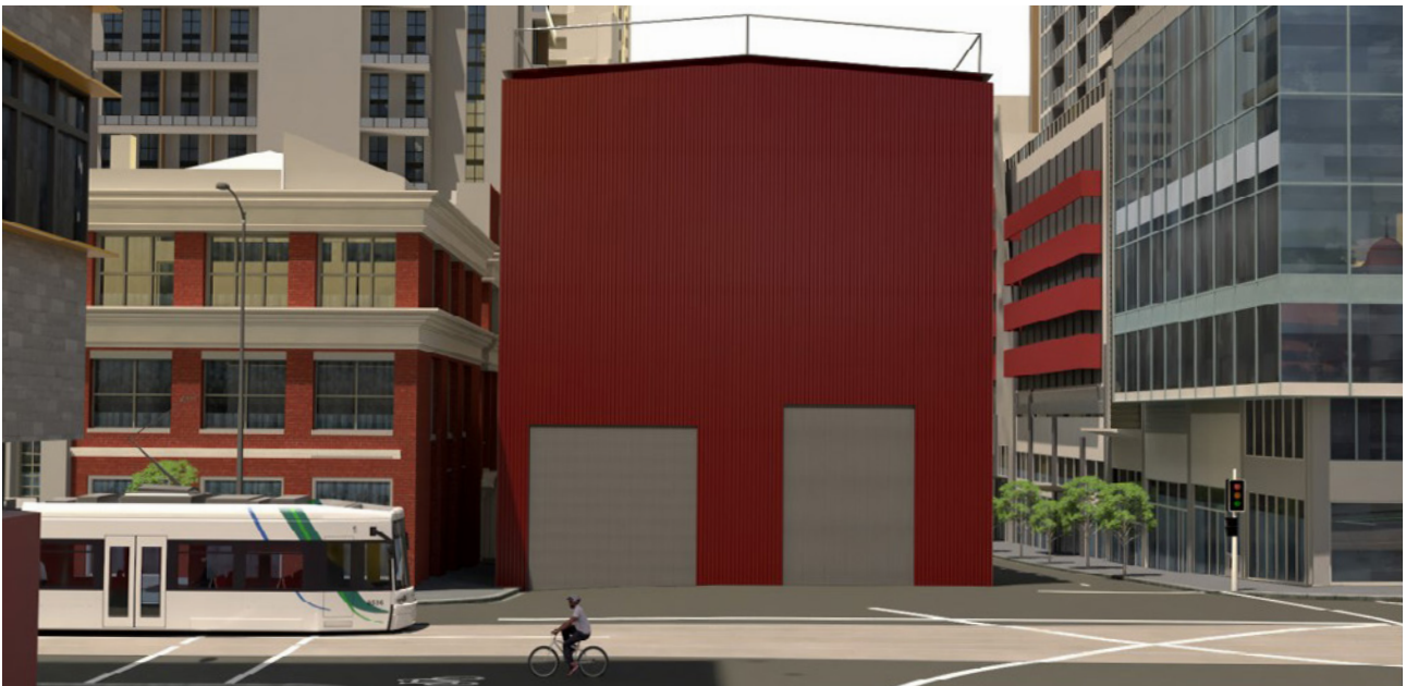
Artist impression of acoustic shed