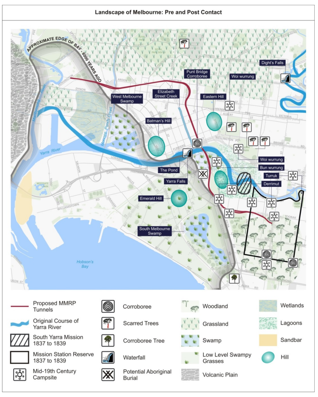
Figure 15-1 Indicative map of the pre- and post-contact Aboriginal landscape of Melbourne