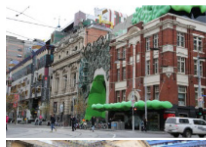
Figure 16-2 Some key features along the Melbourne Metro alignment: Precincts 5, 6 and 7

The CBD North and South station precincts are located at either end of Swanston Street, which is the main civic spine of the city and a strong feature in Melbourne's identity. A key function of the public spaces in these precincts is to provide the opportunity for people to experience a sense of civic pride and ownership.