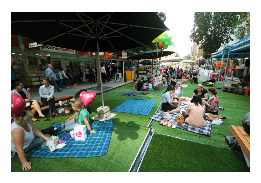
Example of temporary activation of space