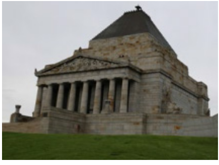
Top to bottom: RMIT (Precinct 5 - CBD North station), State Library forecourt (Precinct 5 - CBD North station), Sw anston Street view to the Shrine of Remembrance (Precinct 6 - CBD South station). Flinders Street Station (Precinct 6 - CBD South station), Shrine of Remembrance (Precinct 7 - Domain station)