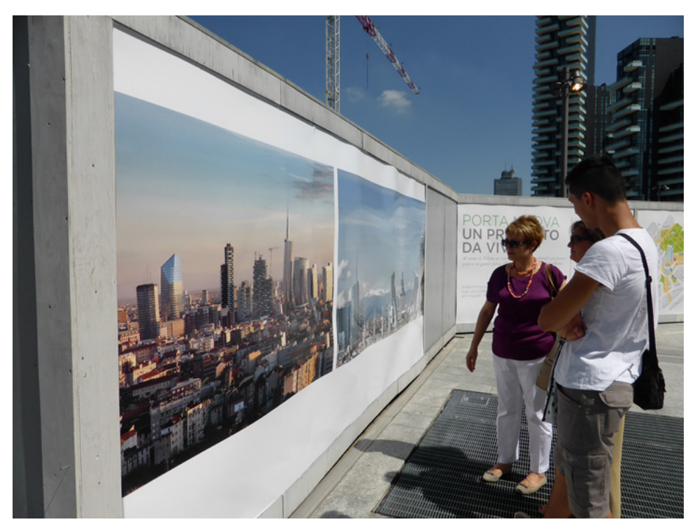
Figure 16-3 Examples of potential mitigation measures for construction

Example of a hoarding being used as a project information board