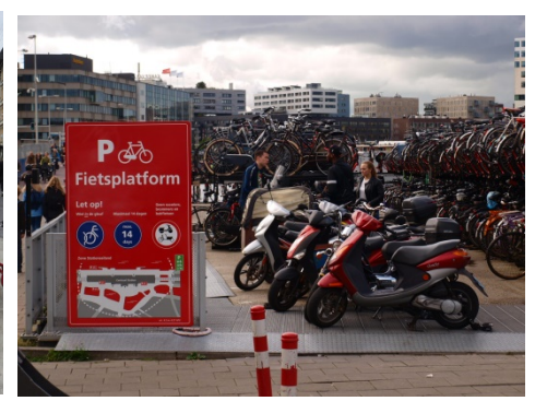
Bike storage main station Amsterdam