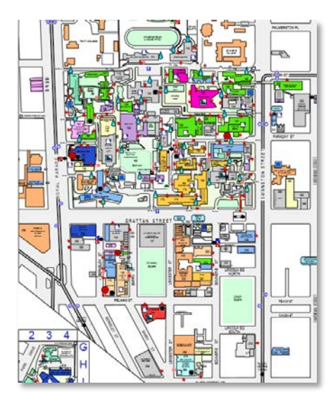
Campus Map showing the substantial University landholdings framing University Square South of Grattan Street